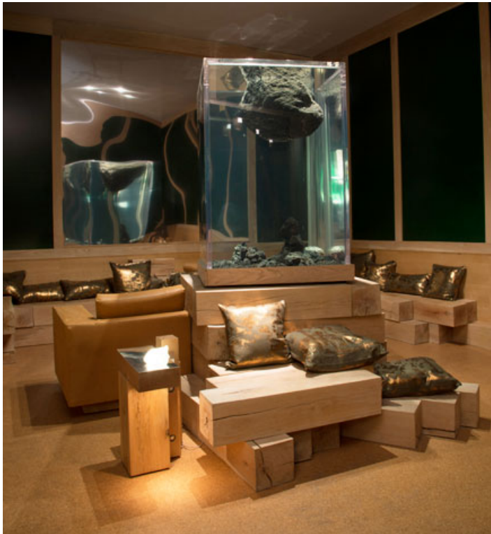
An aquarium by Pierre Huyghe dominates the lounge, creating a natural hub for conversation