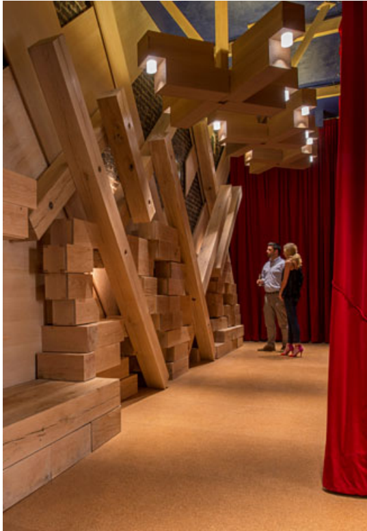
The design by architect Edwin Chan incorporates lighting, wall installations and furnishings made from eight-by-eight white oak beams, specially milled from Golia's forest in Pennsylvania