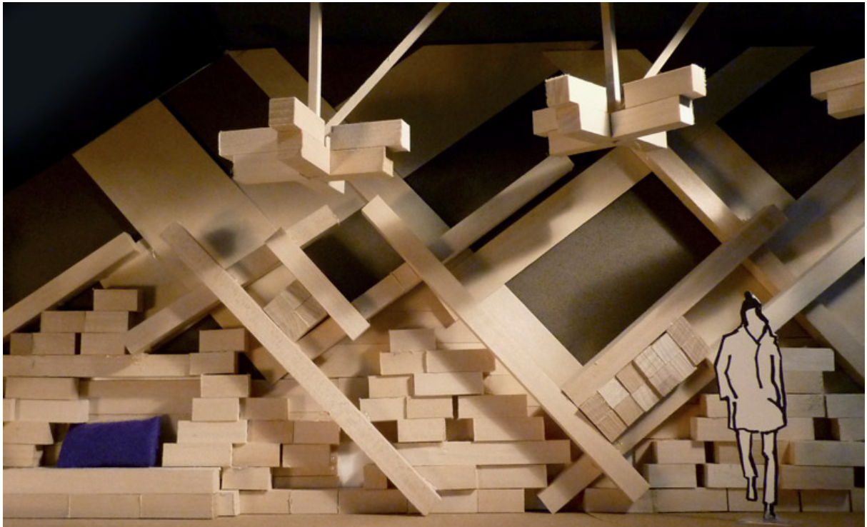
A model of the wooden structure, showing the graphic interlocking of the beams

Jao, Carren. "Chalet Hollywood: artist Piero Golia hosts a creative speakeasy in Los Angeles." Wallpaper (November 6, 2013) [online]