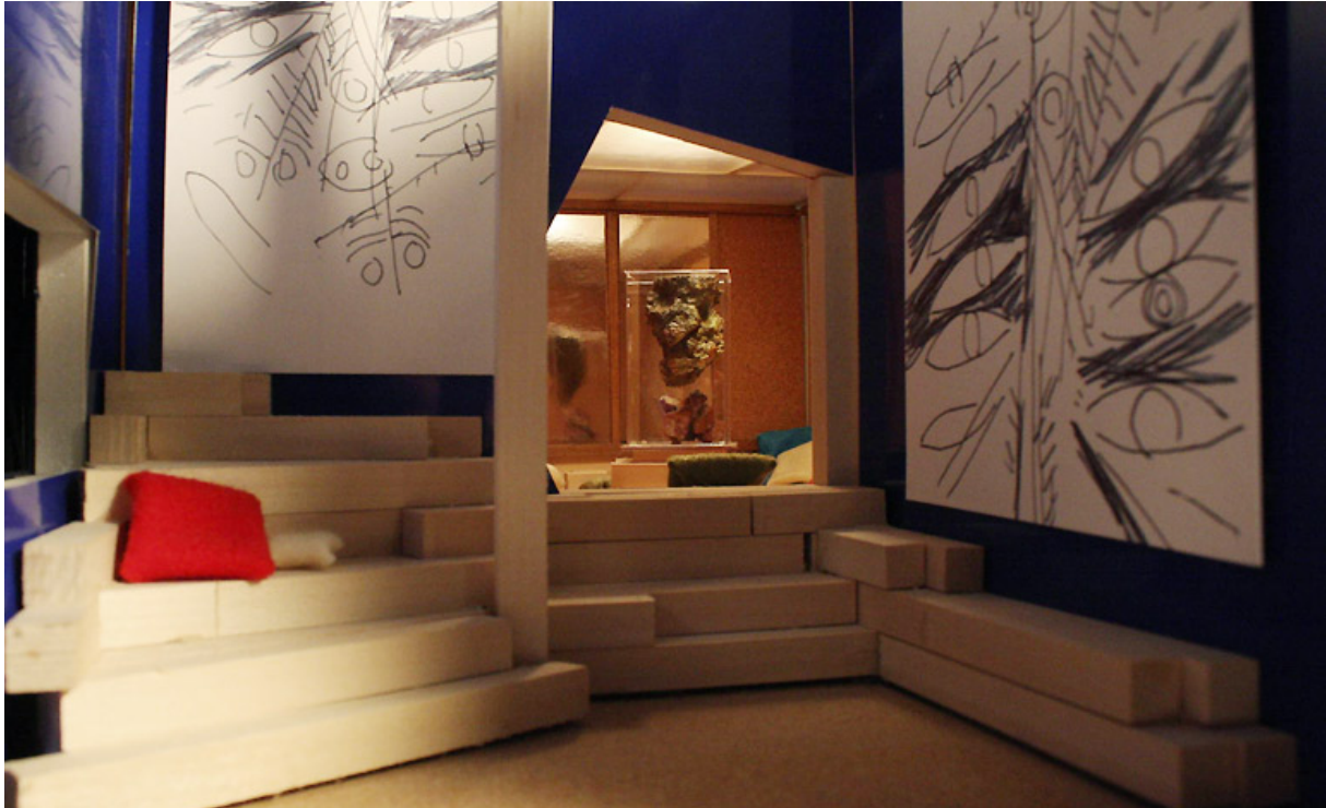
A 3D model by Chan shows the amphitheater, complete with sketches of Grotzahn's works