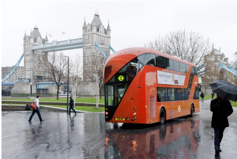
A new bus for London designed by the Heatherwick Studio.