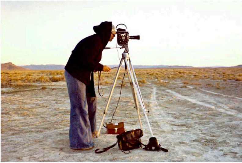
Nancy Holt shooting the film Sun Tunnels, 1978, The Papers of Nancy Holt, Galisteo, New Mexico.