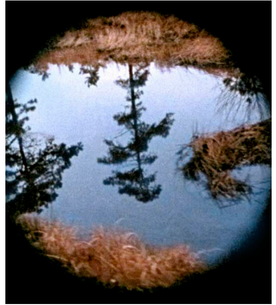
Nancy Holt, Pine Barrens , 1975, still from 16-mm film.