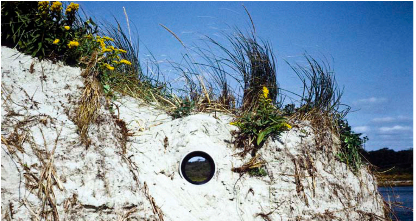
Nancy Holt, Views through a Sand Dune , 1972, cement-asbestos pipe, sand, Narragansett Beach, Rhode Island.

Nancy Holt: Sightlines on view at the Graham Foundation October 7 – December 17, 2011.