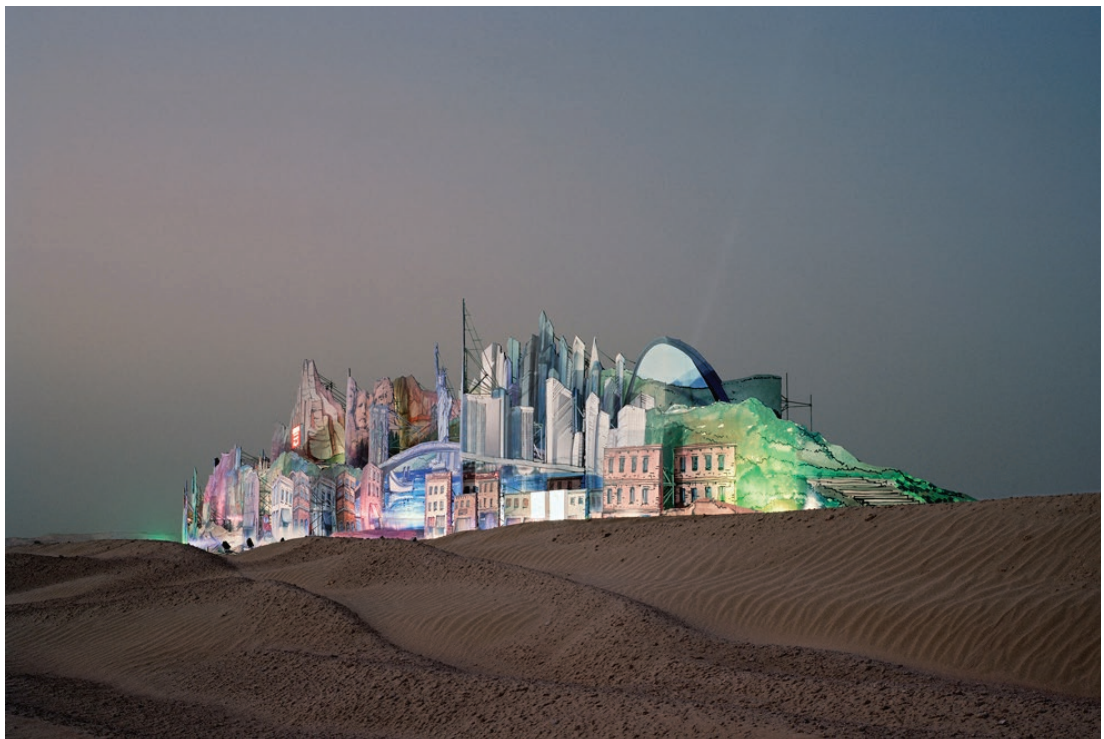
Florian Joy, Bawadi , 2006. Courtesy of the MoCP. From the 2015 Graham Foundation Organizational Grant to Columbia College Chicago-Museum of Contemporary Photography for the exhibition Grace of Intention: Photography, Architecture, and the Monument.

Over $496,000 awarded to 49 groundbreaking architecture projects around the world.