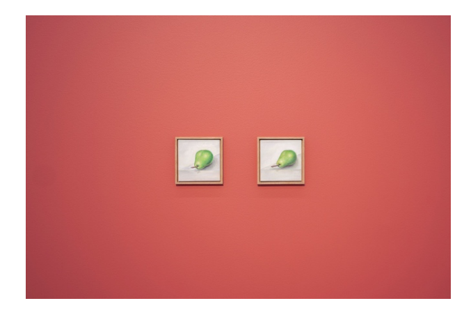
Installation view of Dancing Still Life on a Single Breath , featuring works by Cally Spooner, Fainted Pear and Screen Test for the Psoas Muscle , 2023, Cukrarna, Ljubljana, Slovenia, 2023–24.