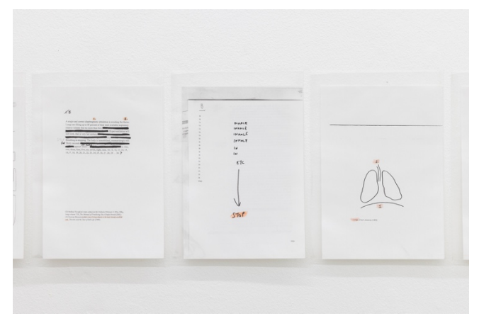
Cally Spooner, Instructions for Dancing Still Life on a Single Breath II (detail), 2021. Laserjet print, marker, watercolour and pencil on paper, pencil and ink on technical paper, plastic, 9 elements, 11 11/16 \times 8 1/4 in. each.