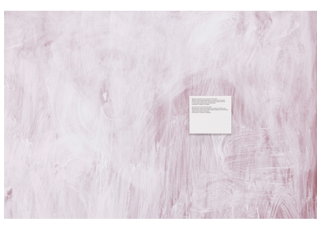
Cally Spooner, Screen Test for the Psoas Muscle , 2023. Existing internal wall, industrial semi-gloss paint, RAL 3033 from raw muscle color chart, white emulsion paint applied with horizontal, vertical and circular movements. Dimensions variable.