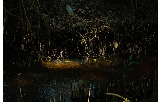
Yvonne Venegas, Mangroves of Río Lagartos in Yucatán, Mexico, Swamp Summit, 2024. Courtesy Storefront for Art and Architecture. From the 2024 grant to Storefront for Art and Architecture for the exhibition Swamplands