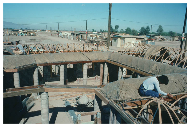
Students working on the roof of the Builder's Yard, Mexicali, Mexico, 1976. Slide, 35mm Kodachrome. From the 2024 grant to INSITE for the publication INSITE Journal_07: A Timeless Way to Build