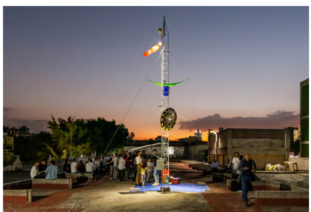
Departamento del Distrito, When models are systems, Mexico City, 2022. From the 2024 grant to LIGA—Space for Architecture for the exhibition LIGA Exhibition Program , 2025