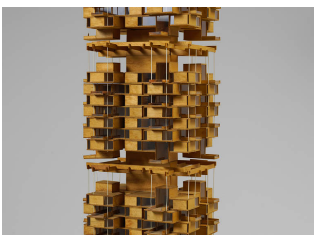
Paul Rudolph, Model for the Graphic Arts Building (detail), ca. 1965. Balsa wood and plastic, 71 x 32 1/2 x 24 1/2 in. From the 2024 grant to The Metropolitan Museum of Art for the exhibition Materialized Space: The Architecture of Paul Rudolph