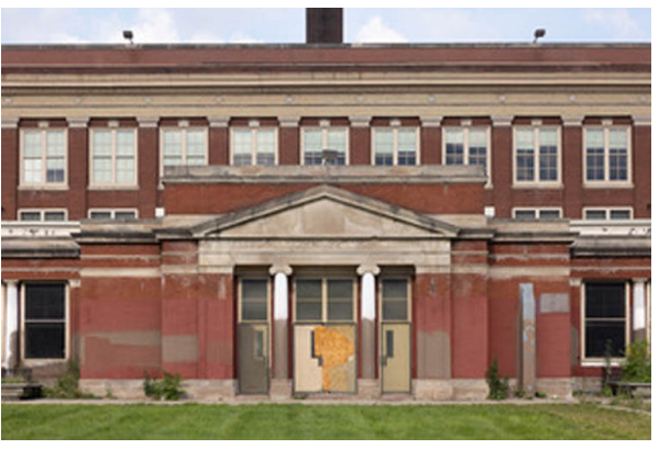
Borderless Studio, Kohn School in Roseland, Chicago, 2023. Digital photograph. From the 2024 grant to Borderless Studio and MAS Context for the publication Beyond Closure: Reimagining Possibilities for Chicago's Closed Schools