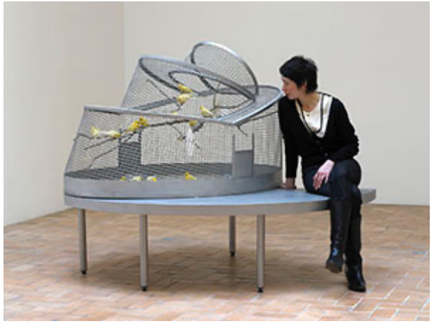
Andrea Blum, Babel , 2008. Stainless steel, 57 x 71 x 71 in. From the 2024 grant to Hunter College Art Galleries for the exhibition Andrea Blum: BIOTA